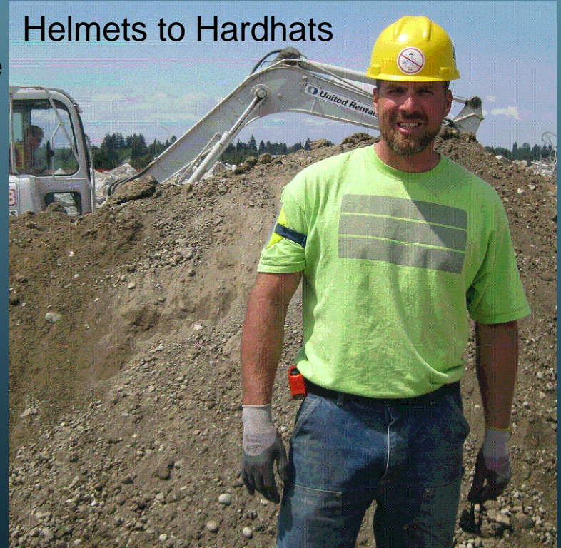
Helmets to Hardhats